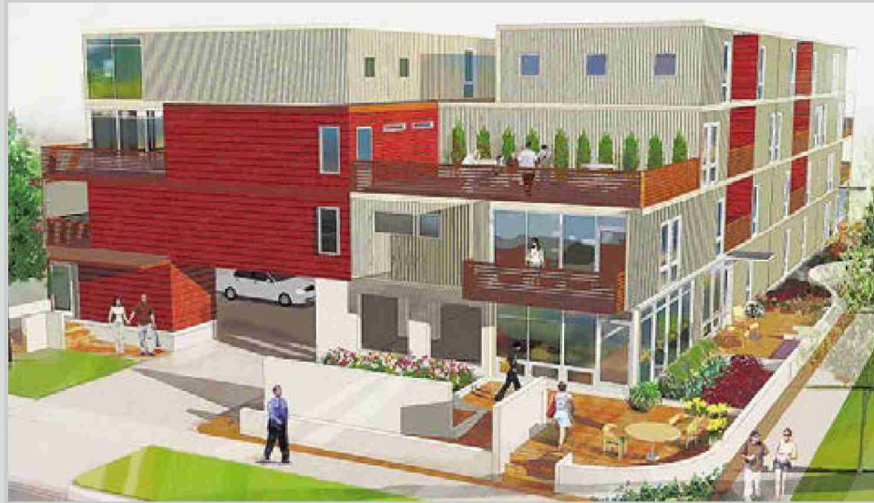
Steven C. Flum Inc.