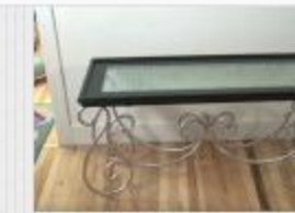
VIDEO: Turn an Ordinary Table into a Zebra-Print Work of Art