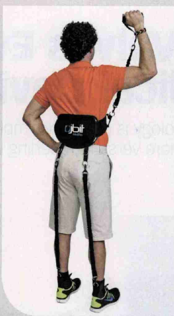
The JB Intensive Trainer can be used to strengthen a number of muscles throughout the body.

It basically gives you a physical-therapy sort of movement by standing up and walking. If you have a bum knee, the product can help strengthen it as it forces you to use the weakened muscles that have been neglected—not from their own neglect, but it just might be painful to get to them. A physical therapist's job is to get around that pain and to force you into dif-