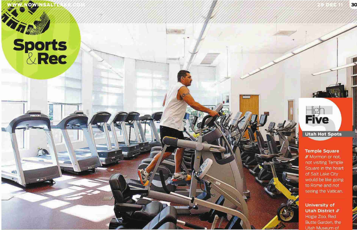
Now in Salt Lake file photo

Men and women around the nation are using websites to help them reach their weight-loss goals and get their gamble on.