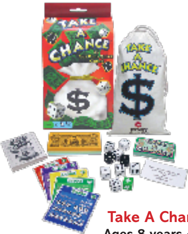
Take A Chance Ages 8 years & up $11.95 Winning-Moves.com