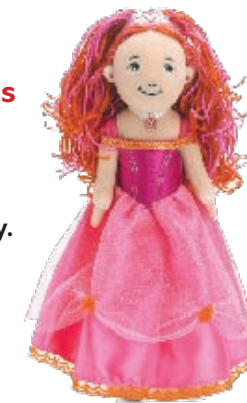
Groovy Girls Isabella 3 years & up $20; ManhattanToy.com

This set of nine sea creatures in vibrant new colors snaps together and pops apart as baby makes a chain of floating fun. All are squeezable and can squirt water. They come in a see-through, mesh fishbowl that doubles as a storage container. Ava, 1, likes the variety of sea creature shapes, pulling the "snapped together" pieces apart and watching the toys float.