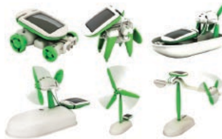
OWI's Solar Powered RobotKit Ages 10 years & up $19.95; OWIRobot.com

Kids' imaginations will take flight in a world of aerial adventures with this portable play set that features all the high-flying details of a real aircraft carrier. The action plays out in the control tower, two working elevators, projectile launcher with two projectiles, a helicopter landing pad and the ability to hold up to eight Sky Buster aircraft. Three-year-old Grant loves the plane. Mom Michele likes that the parts can be stored inside and has a handle so can Grant carry it around.