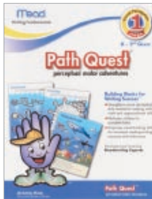
Path Quest Workbook K-2nd Grade $5.99; Mead.com