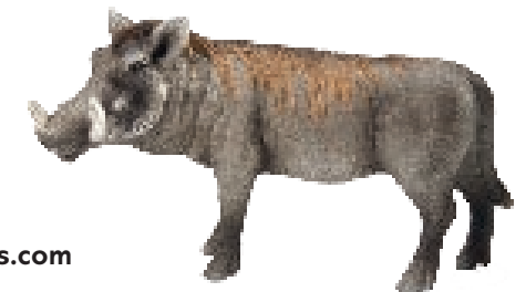
Schleich Warthogs Ages 3 years & up $2.99-$4.49; Schleich-s.com