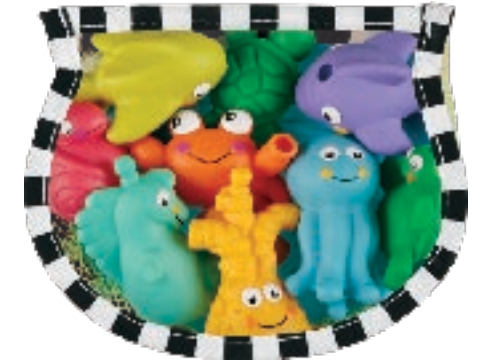
Snap & Squirt Sea Creatures Ages 6 months & up $8.99; Sassy.com

Make bath time "Hot Wheels time" with this splashtastic play set that works in the tub as well as on land! Features a spiral ramp that launches Hot Wheels cars into the water, and the water squirter and "secret" trap door add even more fun. One Hot Wheels car included. Mom Rachel likes that it can be used in and out of the bathtub, and 4-year-old Talon says, "I love the car ramps!"