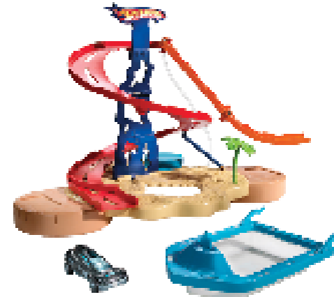
Hot Wheels Tub Racers Play Set Ages 4 years & up $19.99; HotWheels.com