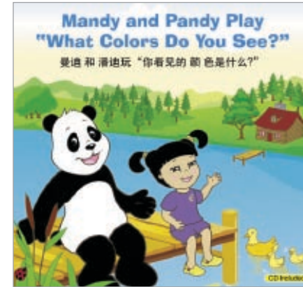
Mandy and Pandy Play "What Colors Do You See?" Ages Pre-K & up $12.95; MandyAndPandy.com

Girls will love these skin nourishing products designed for adolescent "tween" girlie girls. Includes lotion, body wash and lip balm. Also available as Strawberry Kitty Gift Set. Hope, 12, says, "The stuffed kitty is very cuddly and unique and the cat's happy face never fails to make me smile!"