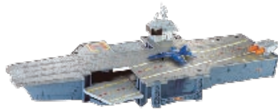
Matchbox Sky Busters Aircraft Carrier Play Set Ages 3 years & up $16.99; Matchbox.com

Finishing a quest provides motivation to complete another task. Other workbooks available include "Snip It!" and "Shape Builders Learn To Draw." Mom Linda likes that there are lots of different activities, colorful pages and the zoo and rocket themes are great for her boys.