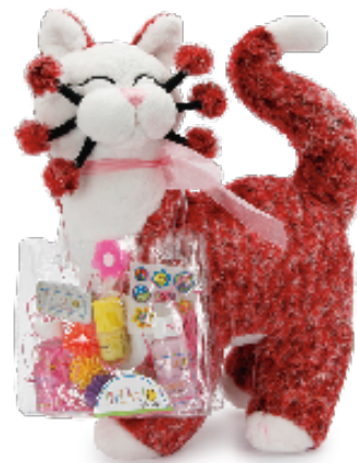
Livi.Lu.Lu Angel Kitty Gift Set 6-16 years $24.96 Herbn-Renewal.com

This 6-in-1 Educational Solar Kit is activated by a mini solar panel that brings each creation to life. Kids can watch the robots they built speed up or slow down depending on light intensity. Powered by outdoor sunshine or indoor halogen lighting. Jason, 10, likes the solar revolving plane and solar car the best and he likes to block the sun and watch his creation stop moving.