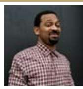
MIKE EPPS, coming soon, to StarDome Comedy Club