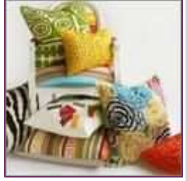
Vivid colors ignite fall Inviting pillows and bedding are Fall essentials

Window treatments. While many love luscious fabrics, an overuse of material on your windows can quickly overpower an otherwise streamlined room. Linen panels are now very trendy since they beautifully outline and soften windows. This classic and timeless fabric is now available in a staggering array of colors to coordinate with any interior palette.