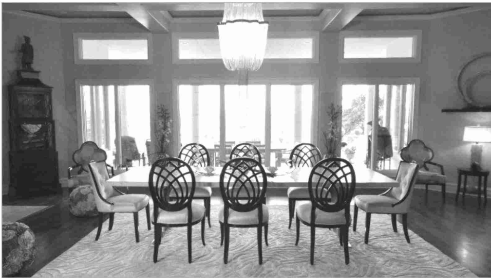
Elaine Williamson Design

Elaine Williamson Designs decorated this dining room with low-emissivity windows, locally sourced mesquite flooring and a table made of Kirei board.