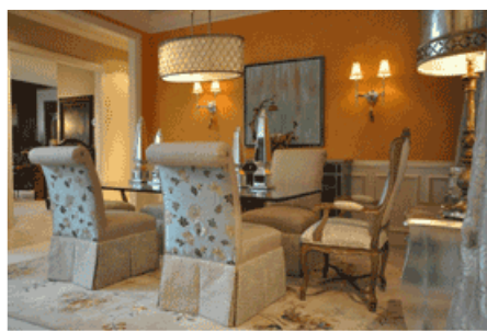
It's only natural: Neutral tones in foundational fabrics provides for latitude in the use of saturated colors in decorating choices (above left and above).

Williamson: Texas is certainly known for its heavily faux-finished walls because the oversized castle-like style homes demand a certain depth of character on the walls to hold their own with the oversized architecture. However, we are guiding our clients away from these finishes as they don't read as timeless. These finishes, if not done correctly, can certainly be overbearing and actually take away from the rest of the home, furnishings included. We are specifying several artistic finishes, which might be an elegant harlequin pattern on walls, bold striping both horizontal and vertical and beautiful finishes on custom-designed furniture pieces.