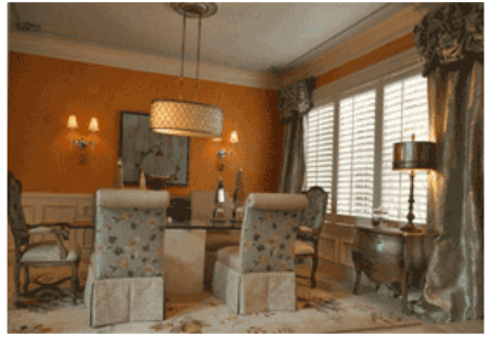
D+D: Are faux finishes still a popular choice for walls? Please elaborate on finish types, effects,

Williamson: Using neutrals as foundational fabrics is definitely my suggestion for homeowners, and provides for greater flexibility in the future. When you do this, you are then able to use color-saturated fabrics in your pillows, dècor accessories and rug choices, and can transition these elemental items as seasons, tastes and trends change. However, that is not to say that we do not use saturated foundational colors in our firm, as we do when the project calls for it. It just certainly depends on the room and the overall design concept for which we are hired. But, generally speaking in today's more cost-conscious market, neutrals are the way to go.