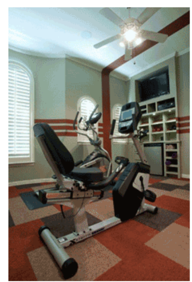
Inspiration, motivation: Color and design a larger space while transforming the uninviting into the chic and inspiring.

D+D:: Could you review how you have seen this translated into designs in recent projects?