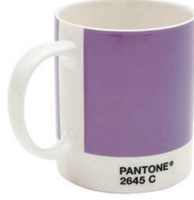
Pantone's lavender, egg yolk and bright lime mugs