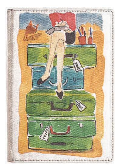
"Bella Travels" canvas Nook cover by Kate Spade New York

f course mom might appreciate a piece of fine jewelry or designer clothing, but she also might want a Mother's Day gift that can be used every day. Those too, provide a mindful token of love. Here are a few pretty, functional ideas.