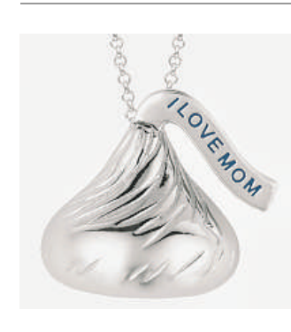
Hershey's Kiss "I Love Mom"