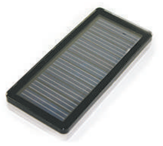
JuiceBar Multi-Device Pocket Solar Charger