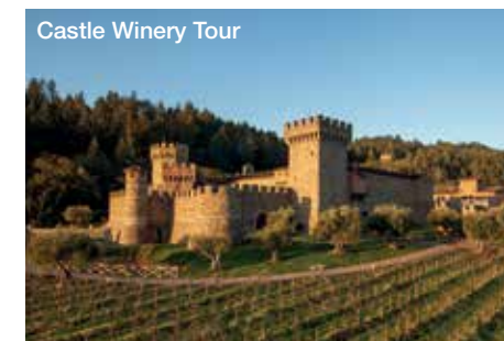
Castle Winery Tour