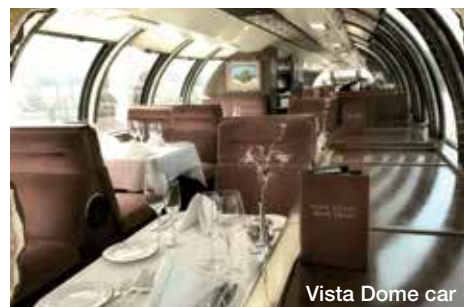
Vista Dome car

Follow her on Twitter here: twitter.com/LuxeListEditor and Facebook here: www.facebook.com/TheLuxeList