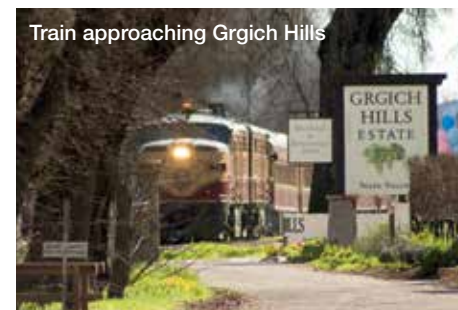
Train approaching Grgich Hills