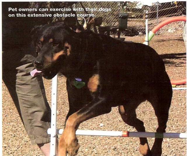
Pet owners can exercise with their dogs on this extensive obstacle course.

Diversity in terrain is an important aspect of building a successful dog park. All dogs don't have the same needs; for example, dogs such as Greyhounds need large open spaces. Dogs that are naturally water dogs, such as Golden Retrievers, need access to water to get proper exercise. So what is the best terrain for your pooch's paws?