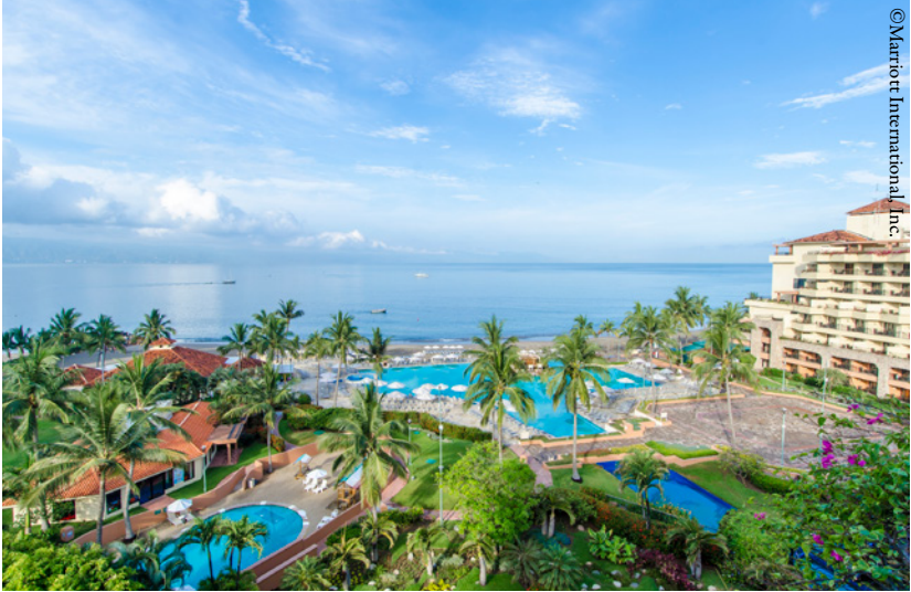
Casa Magna Marriott

Spring has sprung and summer is on rapid approach. Now is the time to plan a respite to a warm and balmy destination where sun, sand and serenity are abundant. Here are seven sunny getaways where endless relaxation, recreational and gastronomic opportunities await.