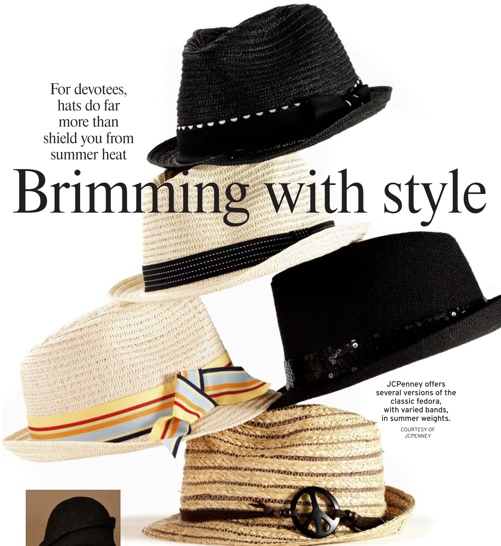
JCPenney offers several versions of the classic fedora, with varied bands, in summer weights.