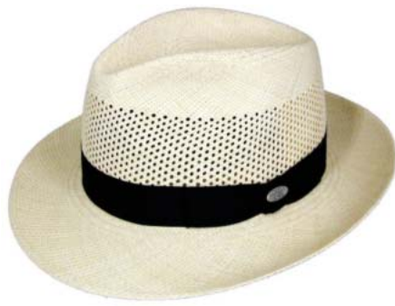
The Retro Panama straw hat is hand-blocked in the USA.

Panama: The classic straw hat, usually made in Ecuador.