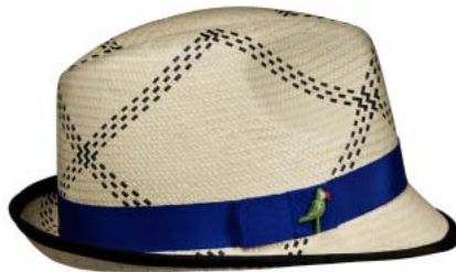
Target is selling a line of limited-edition toppers, including this fedora.