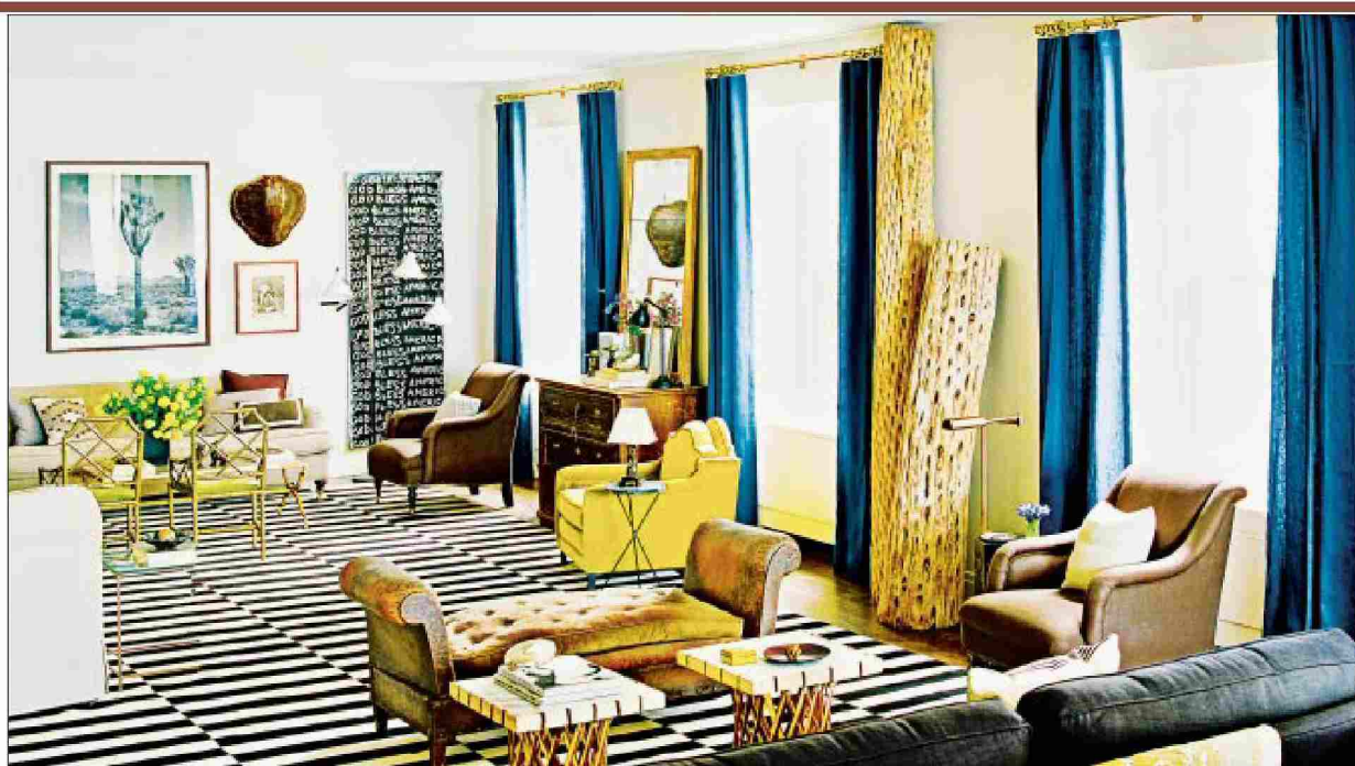
Madeline Weinrib's striped rug mixes beautifully with solid upholstery and ethnic textures in designer Nate Berkus' living room.