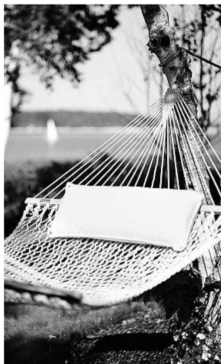
Soft cotton rope hammock with oak spreaders, $99 at www.llbean.com