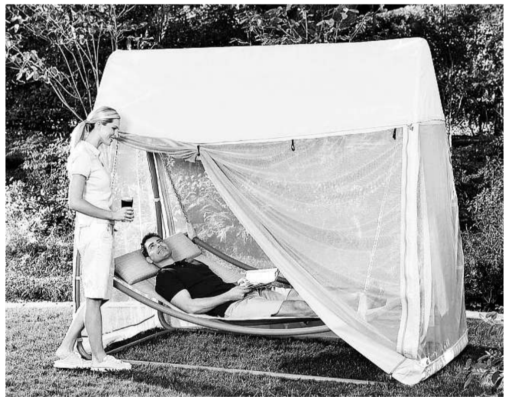
Gannett News Service