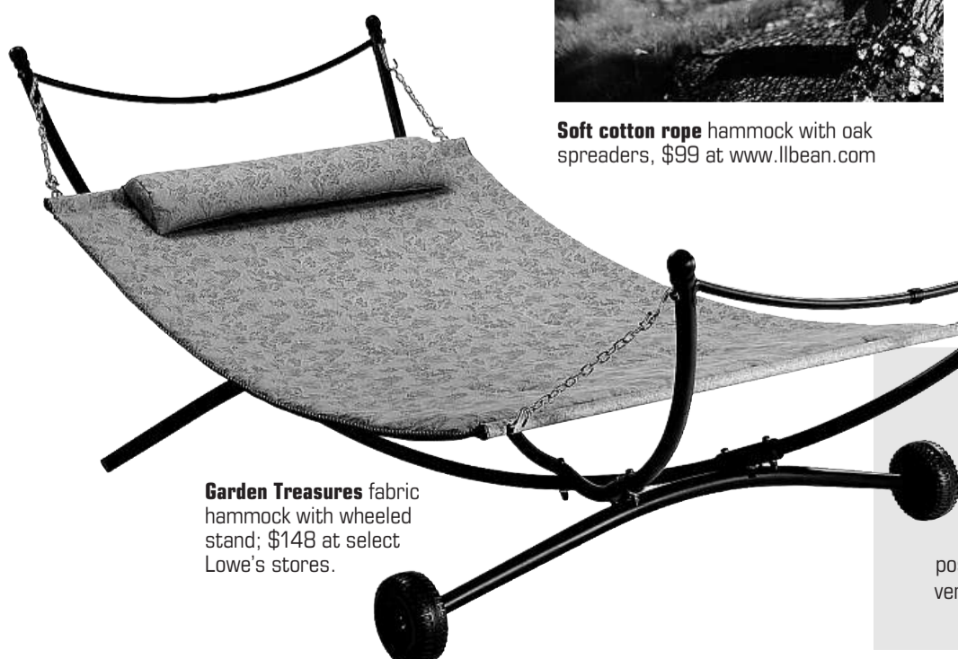
Garden Treasures fabric hammock with wheeled stand; $148 at select Lowe's stores.