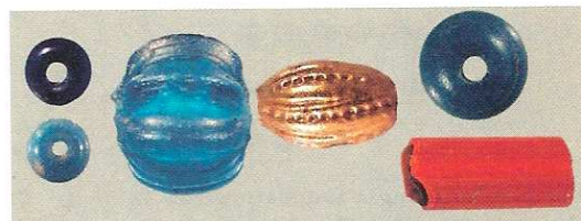
Left to right: Cobalt blue seed bead, Venice, Italy (top); turquoise/blue-green seed bead, Venice, Italy (bottom). Blue-green melon bead, China. Gilded oval glass bead, Spain. Ichtucknee turquoise blue bead, probably France (top); Green Heart bugle bead (red-orange glass over green glass with clear veneer), the Margariteri guild of Venice, Italy (bottom).

Bead Bounty Talk about a stash! Scientists have unearthed about 70,000 beads under the ruins of a Spanish mission off the coast of Georgia. The Santa Catalina de Guale Mission, which served as the northernmost outpost of the Spanish empire and provided food and labor to Spanish Florida, was abandoned in the late 1600s. The 130 types of beads found there include French and Chinese blue glass, Dutch layered glass, and Baltic amber. Others are from Venice and India. Although some of the beads were found inside the walls of the mission, most were discovered with individuals buried in the cemetery. Researchers speculate that the number and type of beads buried with a person may represent his or her status within Guale society. The beads—currently housed at the American Museum of Natural History in New York—will move to the Fernbank Museum of Natural History in Atlanta, Georgia, in early January 2010. Visit www.amnh.org and www.fernbankmuseum.org .